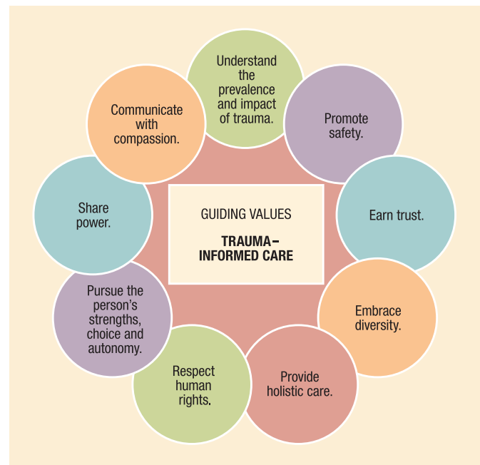
Wisconsin Trauma-Informed Care Initiative symbol